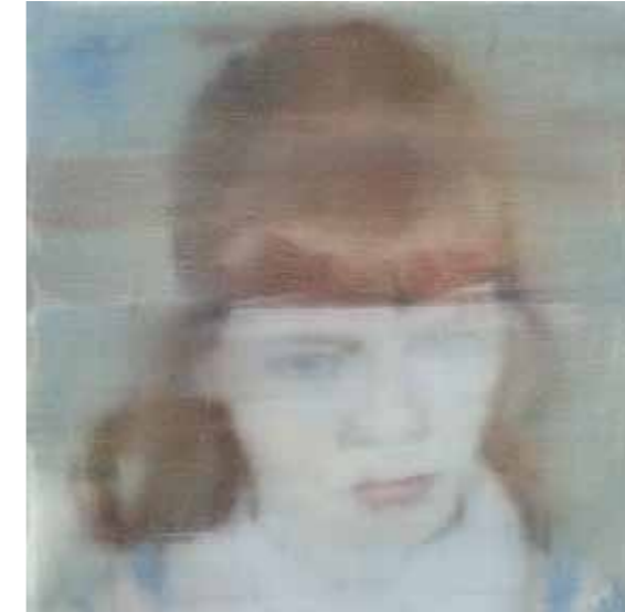
Red-haired Girl oil on linen 20 x 24 cm