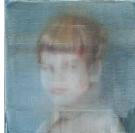
Smug Girl oil on linen 30 x 30 cm