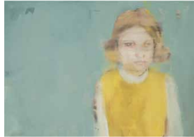
Surly Girl oil on canvas 50 x 70 cm

On Passage is an ornithological term, referring to migrating birds en route to a final destination. Coming late to parenting, I perhaps observe my children and childhood from a different perspective than I might as a younger mother. I am very much embroiled in the tense comedy of education and nurturing, and the passage through childhood into adolescence.