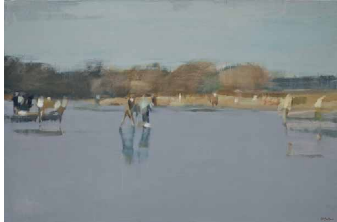
Frozen Lake II oil on canvas 60 x 91 cm