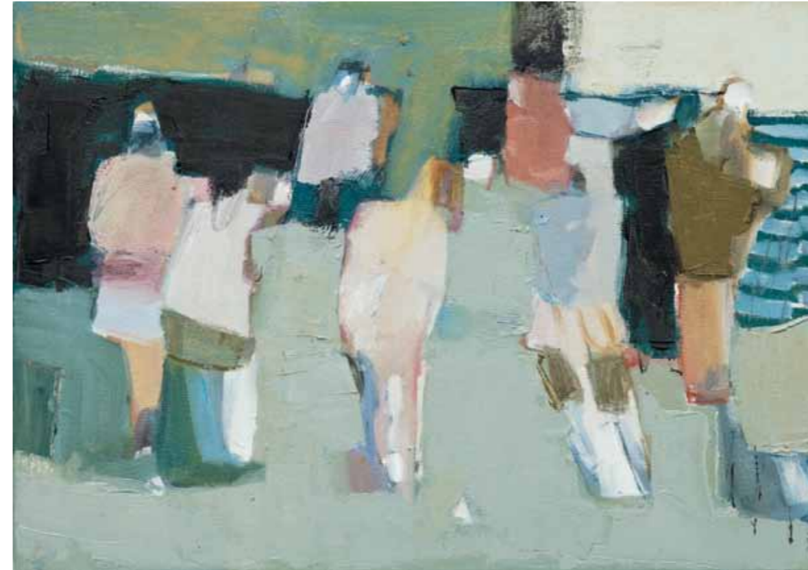
70s Playground oil on canvas 50 x 70 cm