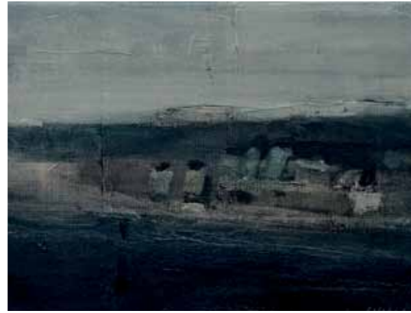
Night Fishing oil on canvas 30 x 40 cm