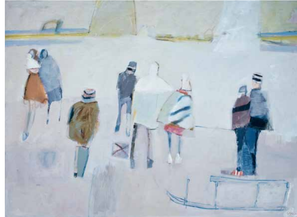
Sledding with Lovers oil on canvas 90 x 120 cm