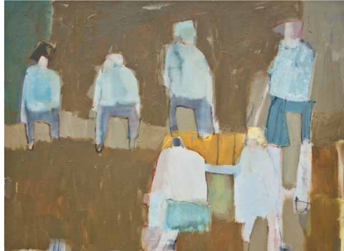
School oil on canvas 80 x 100 cm