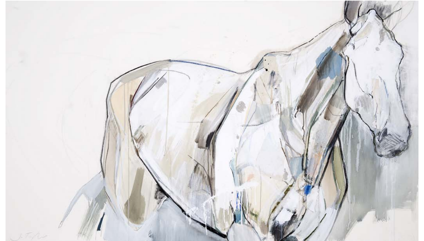
Monster II , mixed media , 32" x 57" (81.3 x 144.8cm)