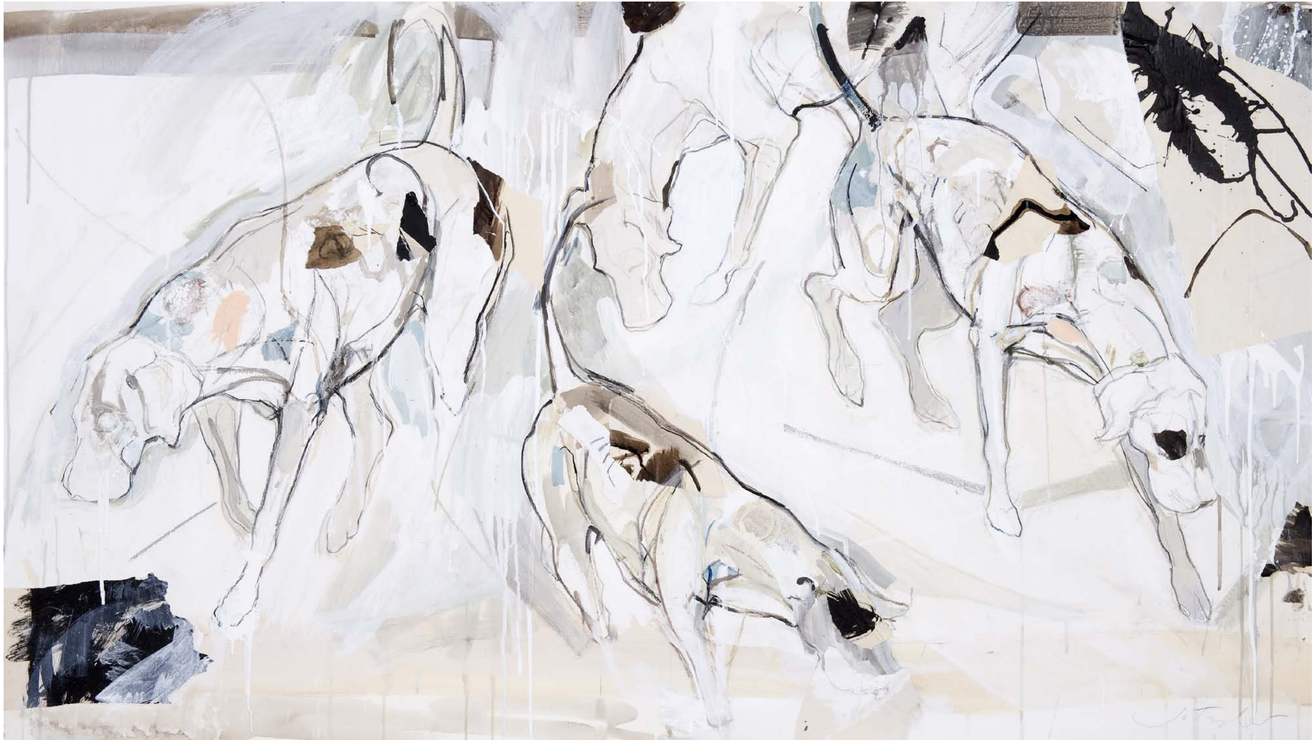
Hounds mixed media 32" x 56" (81.3 x 142.2cm)