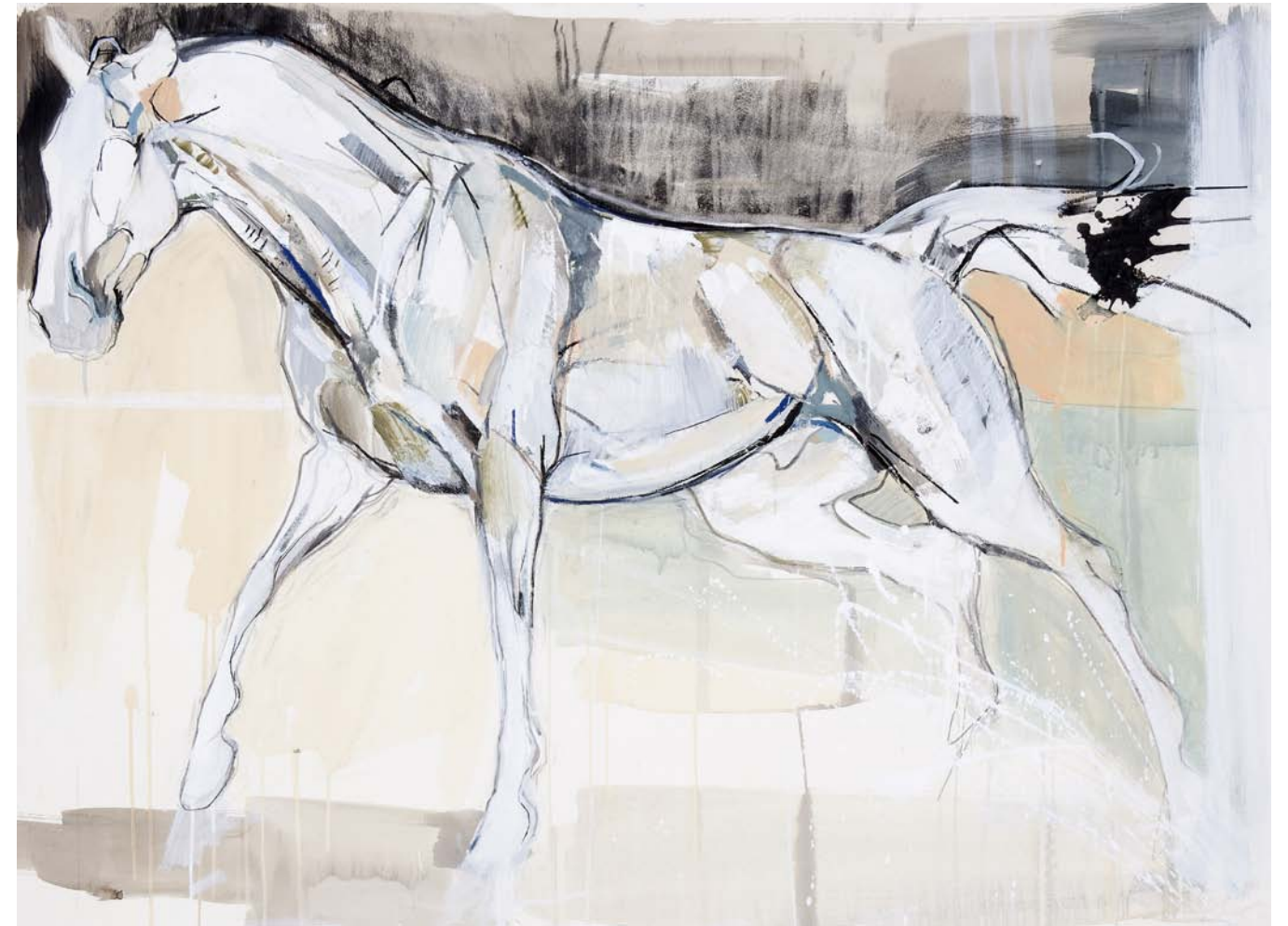
Free Horse, mixed media, 32" x 44" (81.3 x 111.8cm)