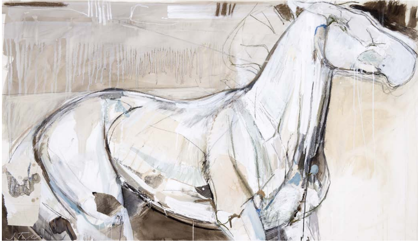
Plains Horse I, mixed media , 32" x 57" (81.3 x 144.8cm)