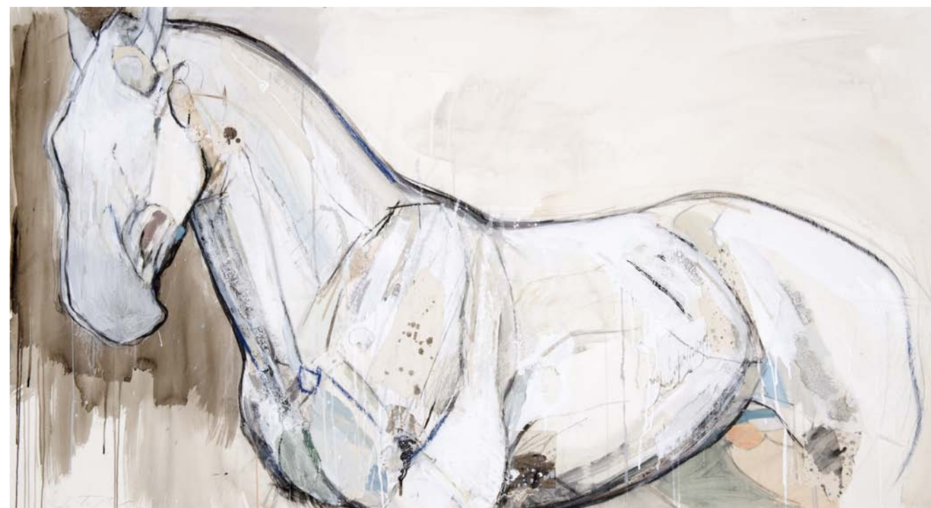
Pale Mountain , mixed media , 32" x 57" (81.3 x 144.8cm)