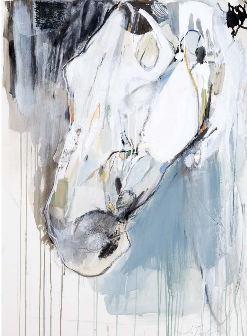
Hot Globes mixed media 33" x 24" (83.8 x 61cm)