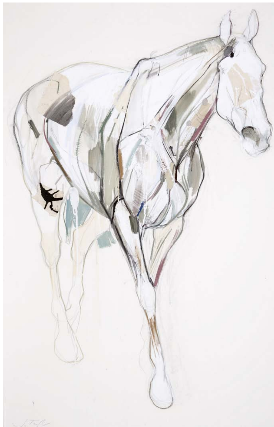
Monster I mixed media 52" x 33" (132 x 83.8cm)