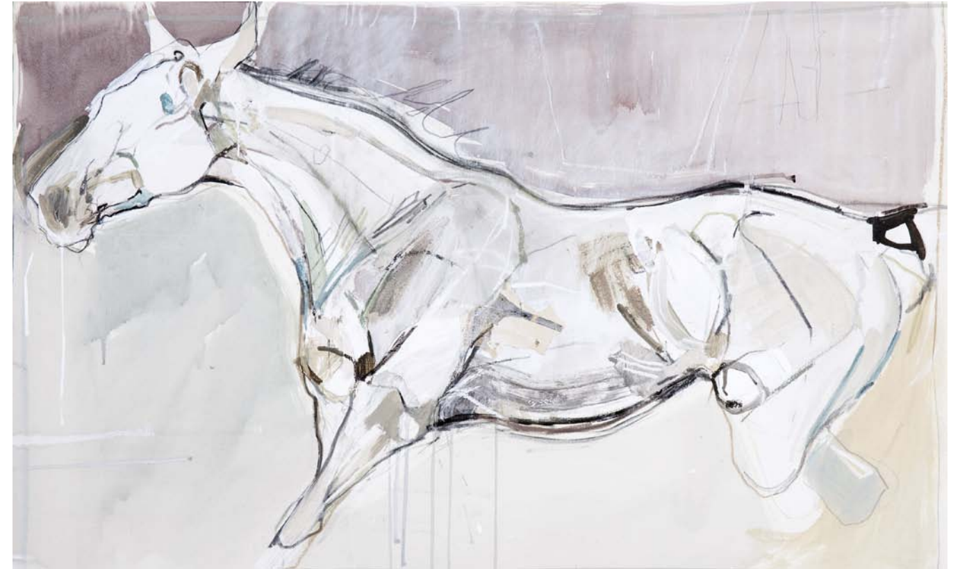
Riderless Horse, mixed media , 26" x 36" (66 x 91.4cm)