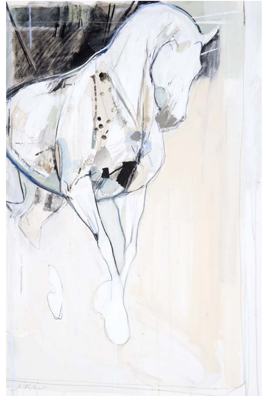
Casual Garcia mixed media 38" x 22" (96.5 x 55.9cm)