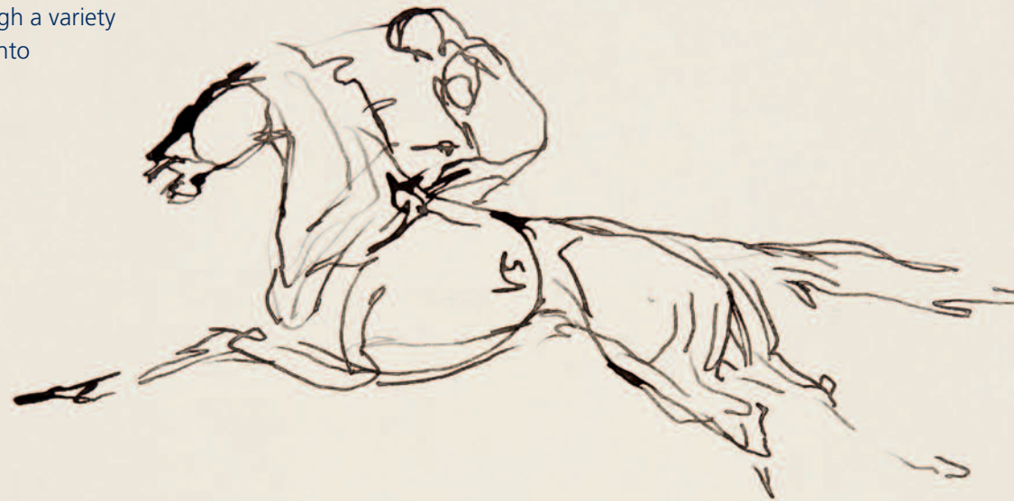
Right: The Heath I, Ink on paper, 6" x 10" (15.2 x 25.4cm)