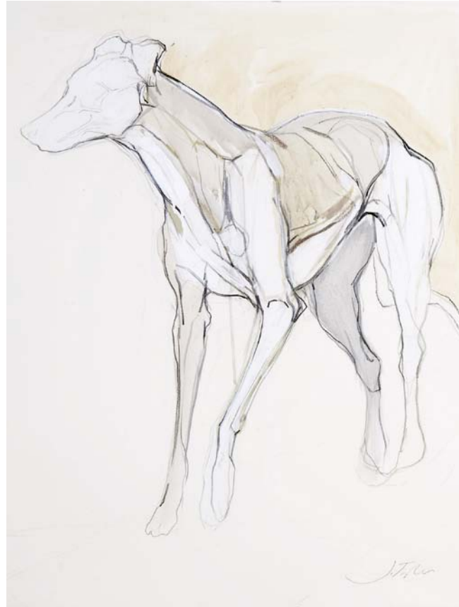
The Rescue I, mixed media , 30" x 22" (76.2 x 55.9cm)