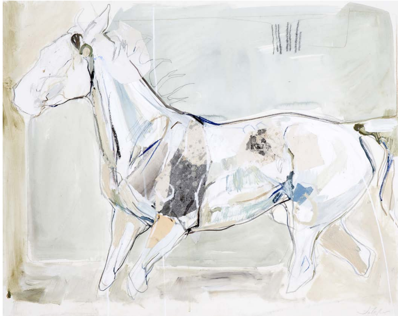
Plains Horse II, mixed media , 26" x 36" (66 x 91.4cm)