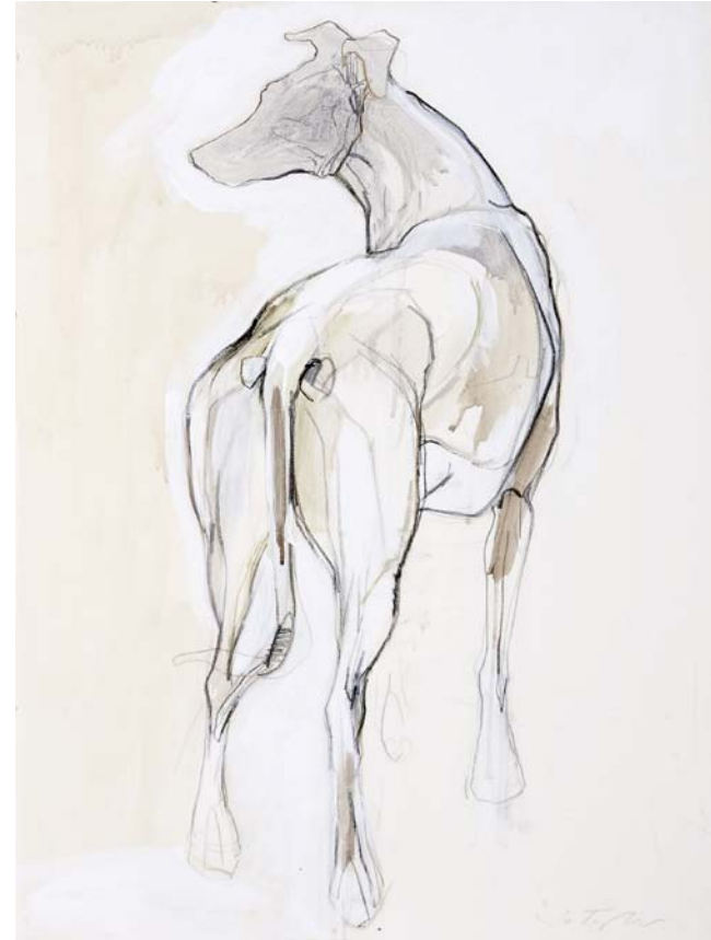
The Rescue II, mixed media , 30" x 22" (76.2 x 55.9cm)