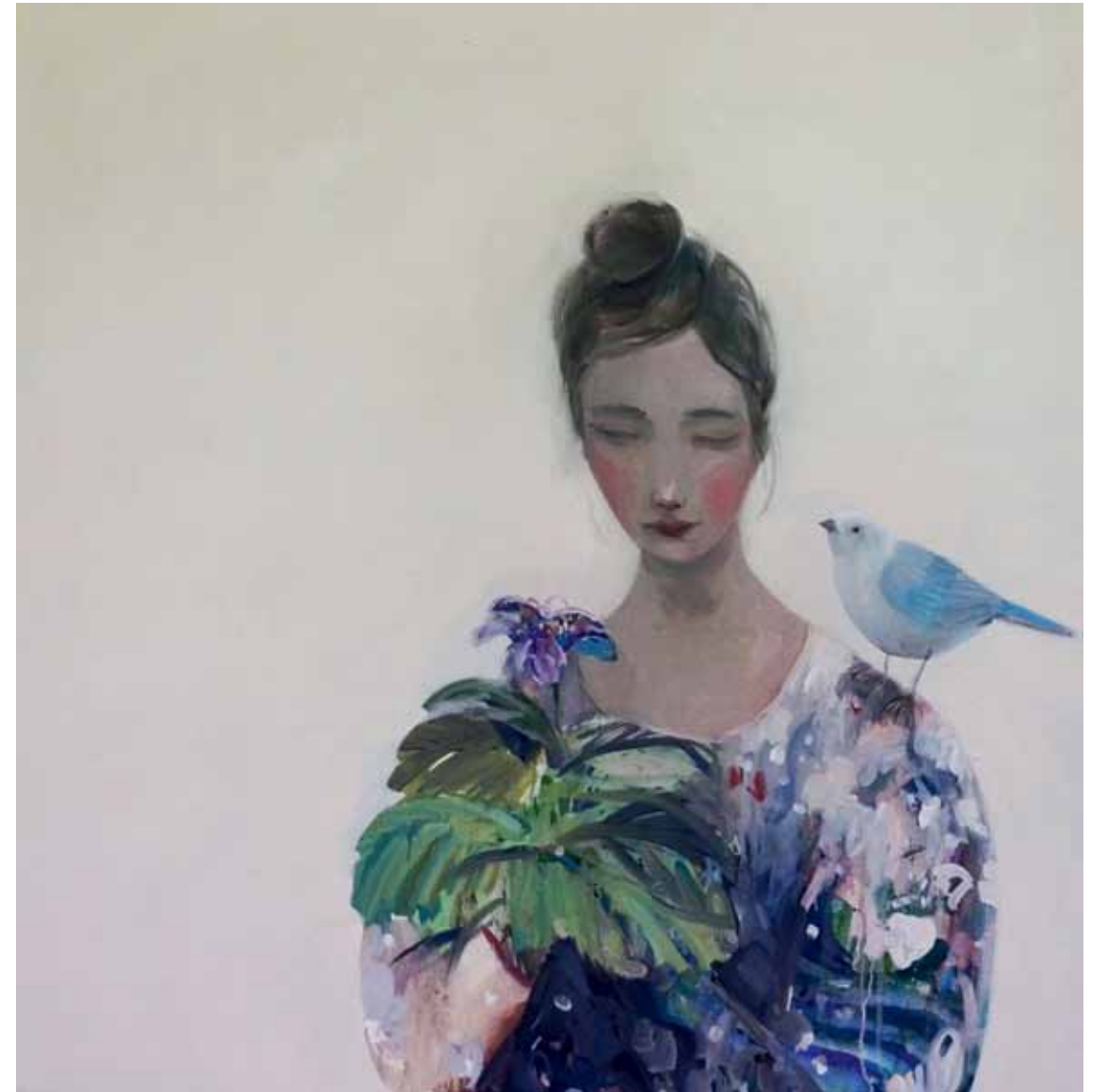
Just listen oil on canvas 80 x 80 cm