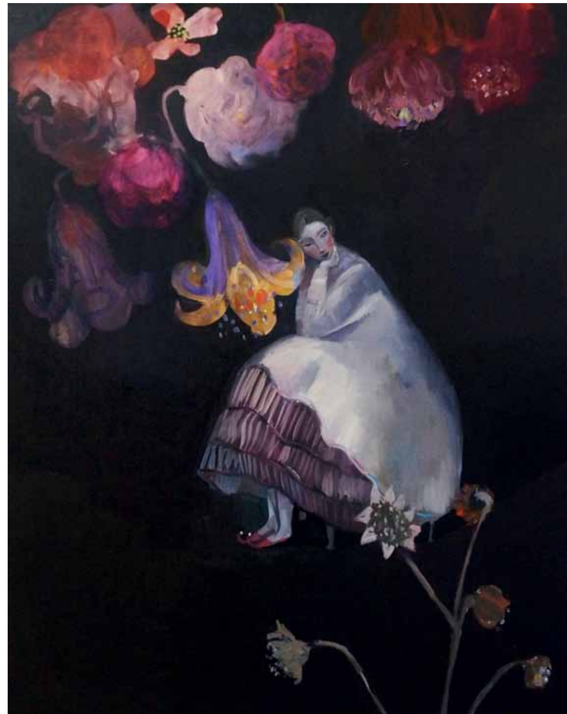
Just sitting here oil on canvas 100 x 80 cm