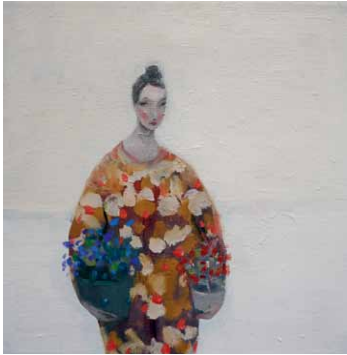
Both oil on canvas 20 x 20 cm