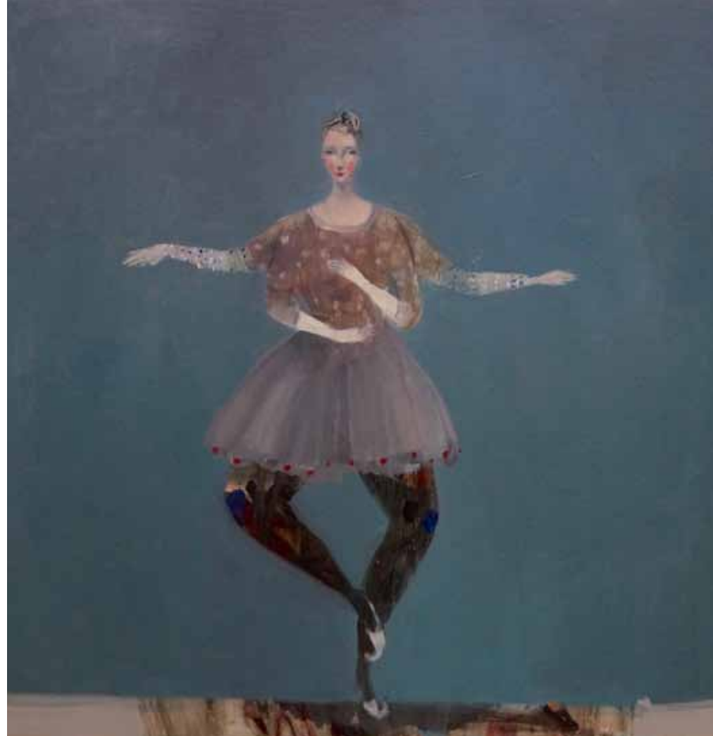
Along oil on canvas 50 x 50 cm