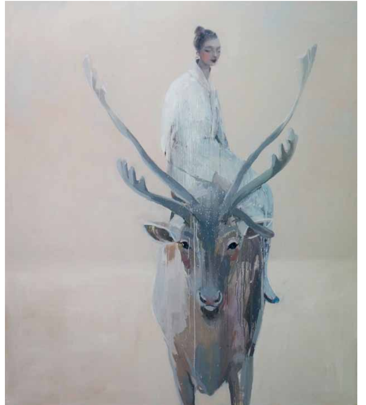
Inescapable oil on canvas 160 × 140 cm