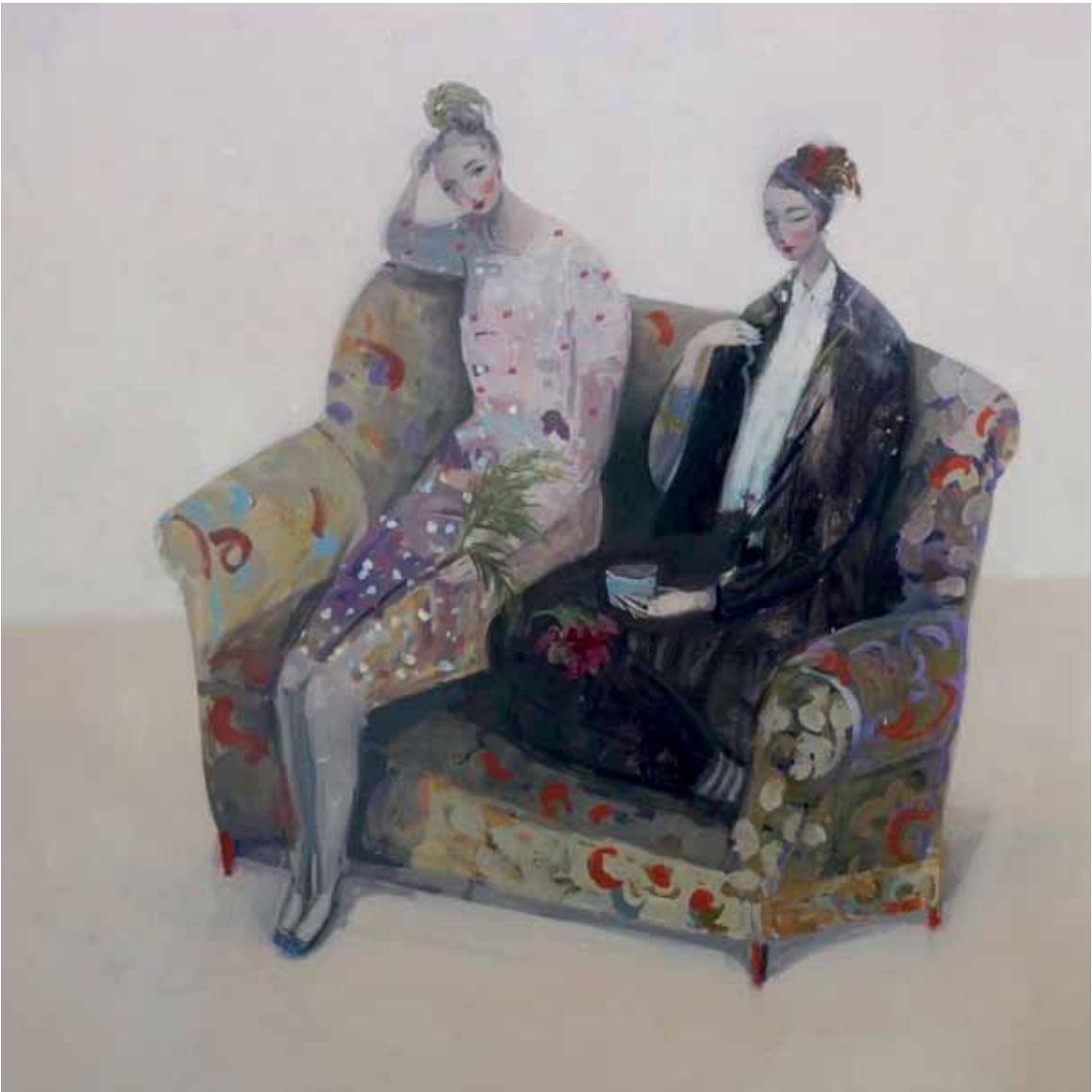
A gentler presence oil on canvas 80 x 80 cm