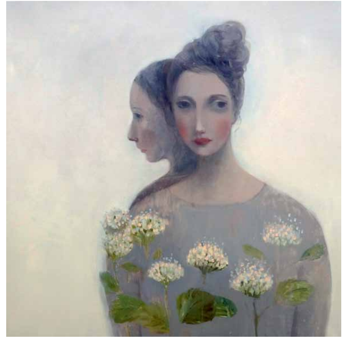
Possibly oil on canvas 80 x 80 cm