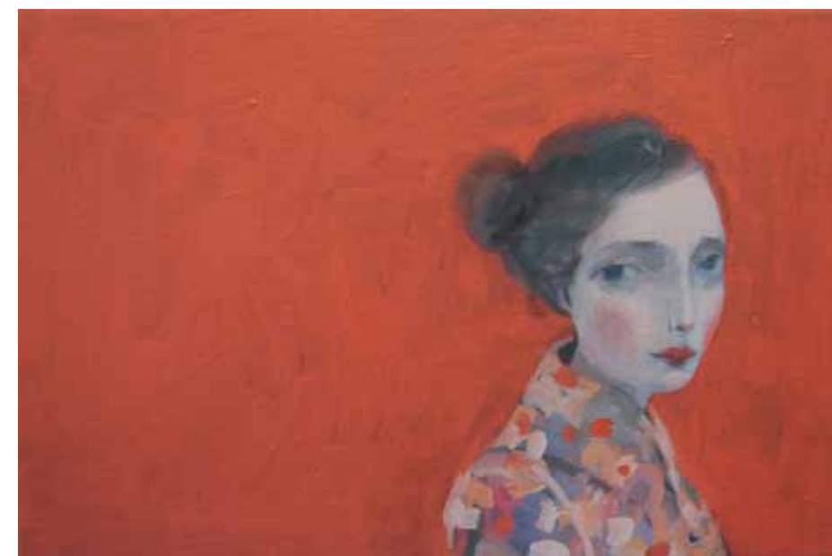
Red oil on canvas 20 x 30 cm