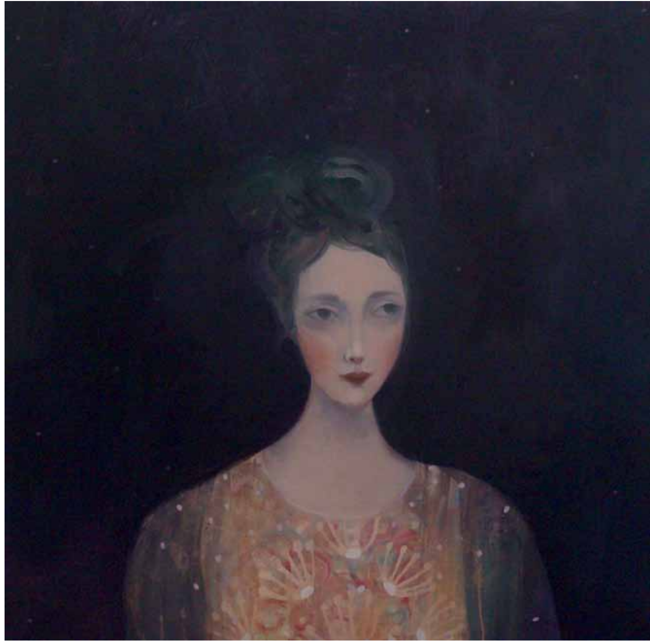
Between her and the universe oil on canvas 90 x 90 cm