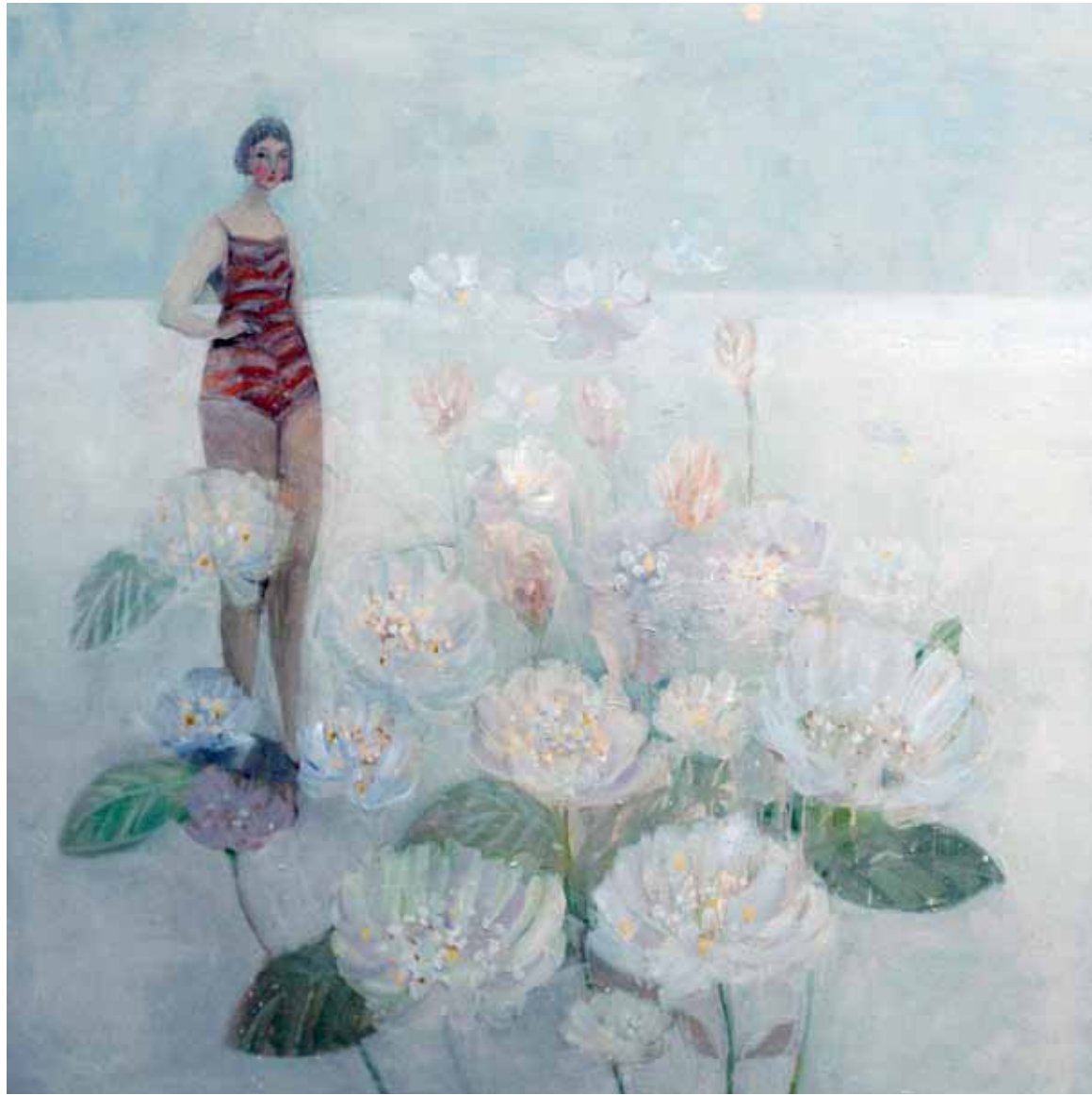
Waking up oil on canvas 80 x 80 cm