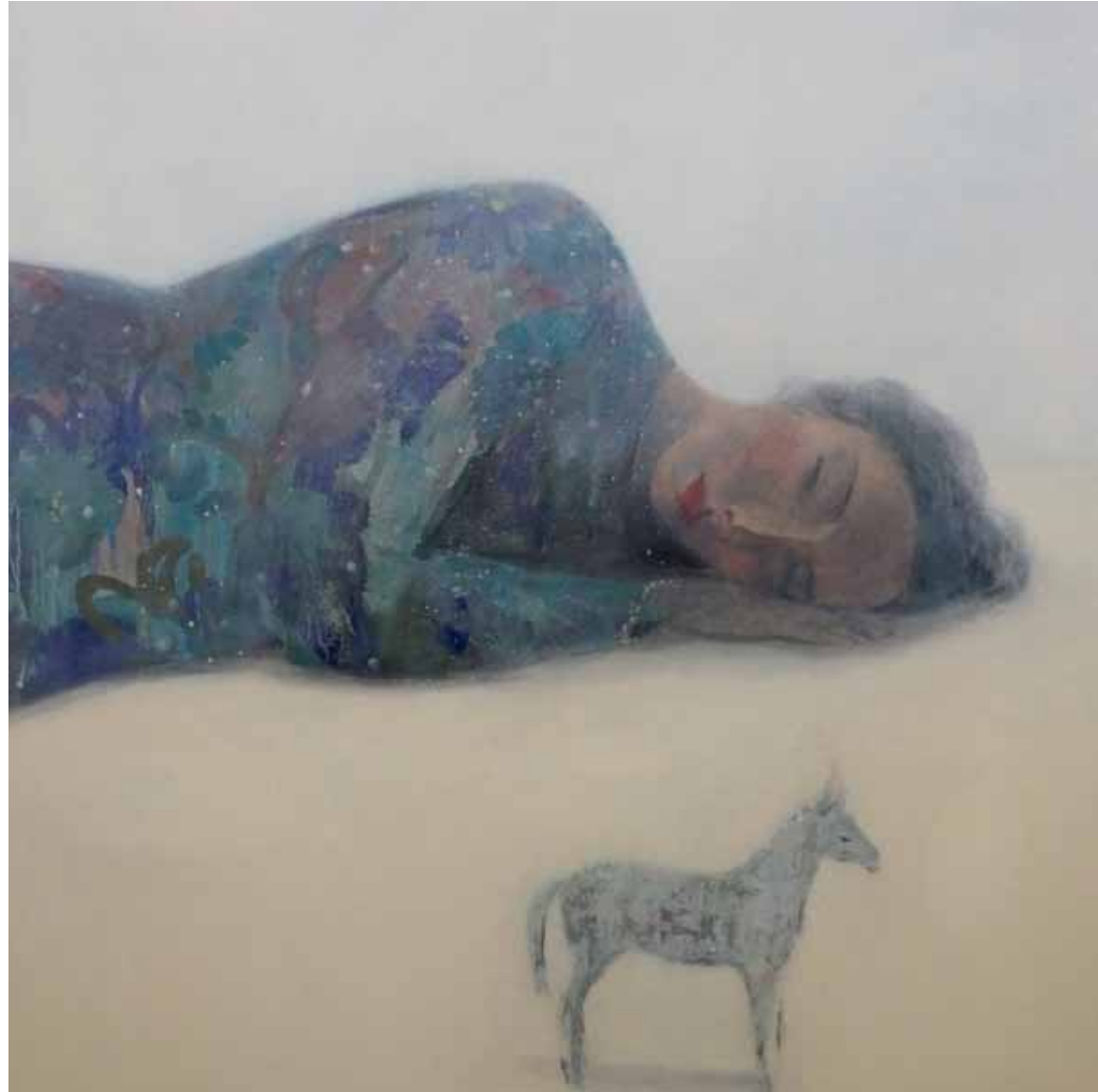
Wait for me oil on canvas 80 x 80 cm