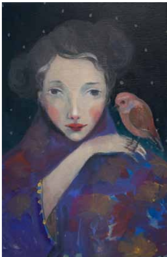
Where can we go oil on canvas 30 x 20 cm