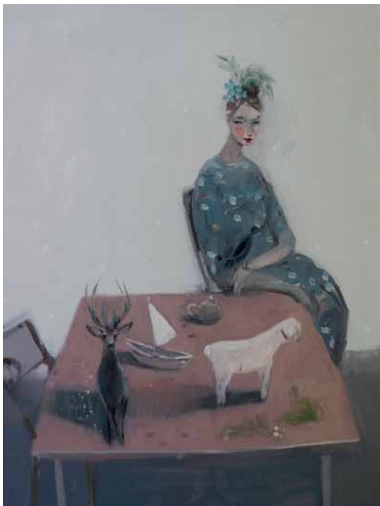
Next move oil on canvas 40 x 30 cm