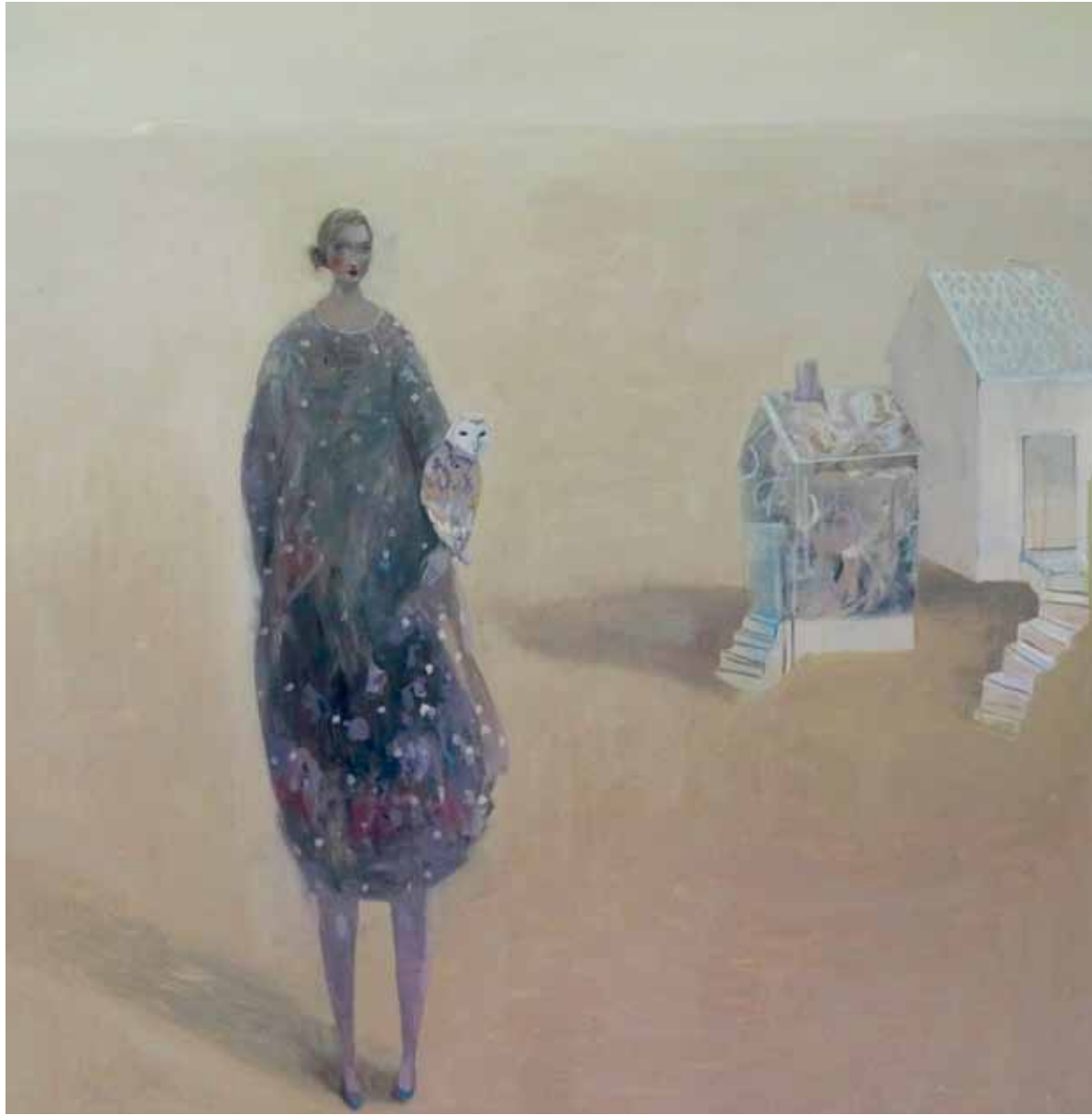
Timeless oil on canvas 90 x 90 cm