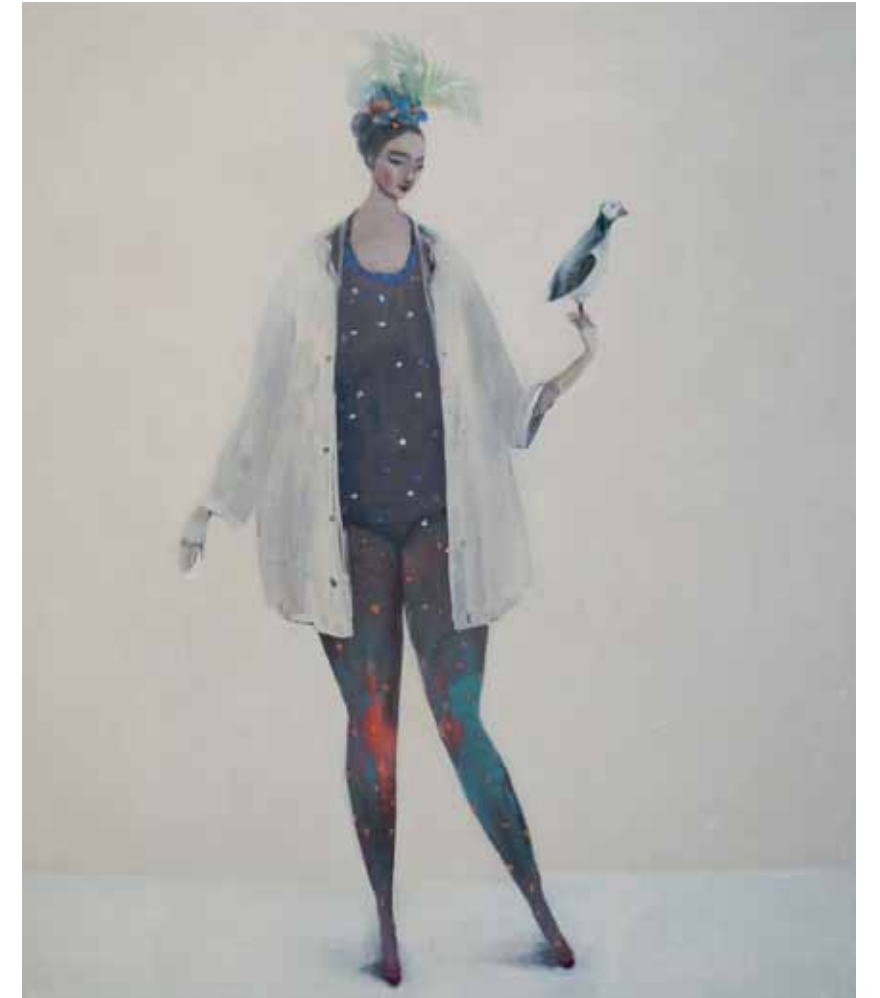
After you oil on canvas 70 × 60 cm