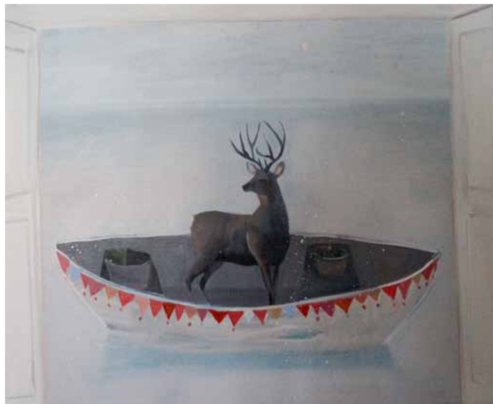
Drifting roots oil on canvas 50 x 60 cm

First published in 2017 by Campden Gallery Ltd High Street, Chipping Campden, Gloucestershire GL55 6AG www.campdengallery.co.uk