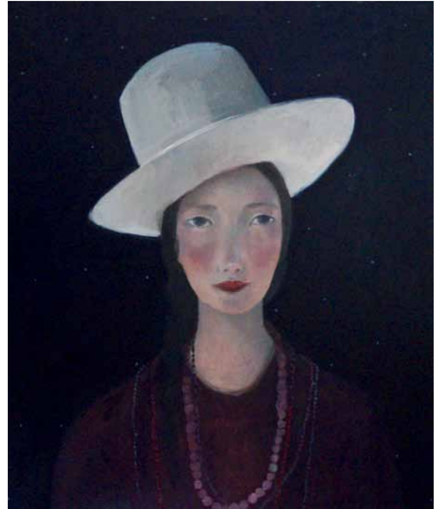
Velvet oil on canvas 70 x 60 cm