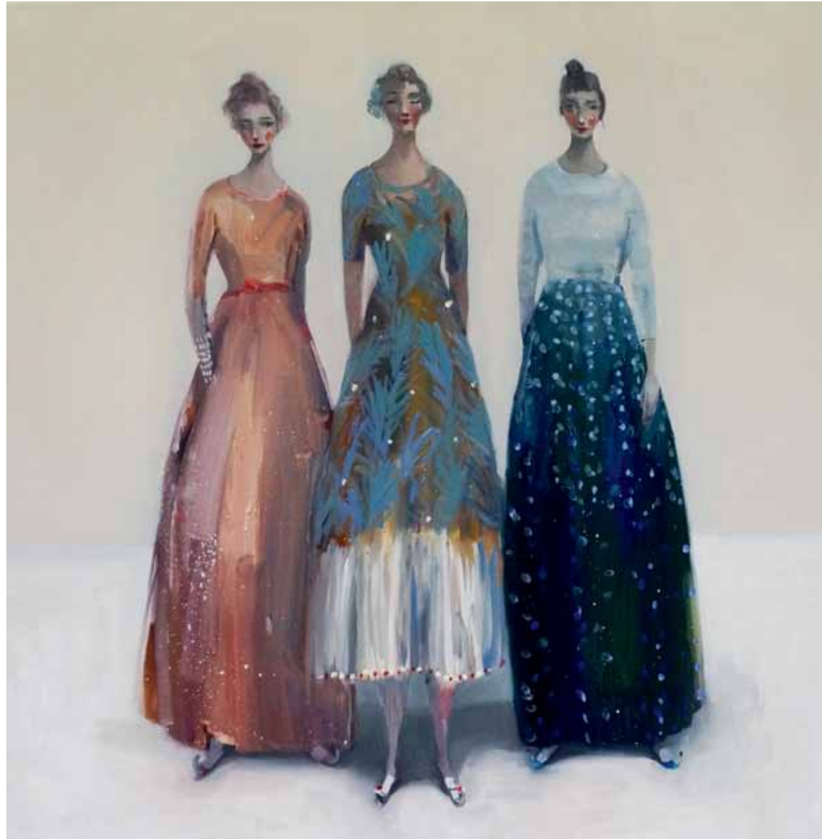
Some wisdom oil on canvas 80 × 80 cm