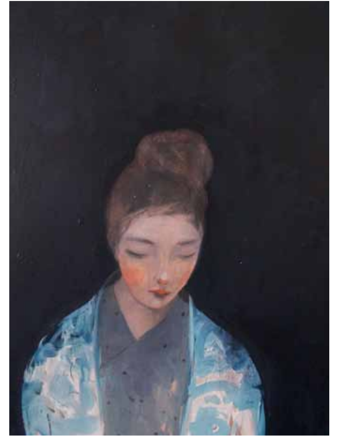
After oil on board 40 x 30 cm