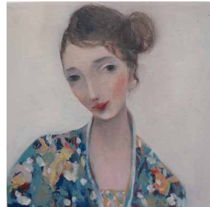
To the source oil on canvas 20 x 20 cm