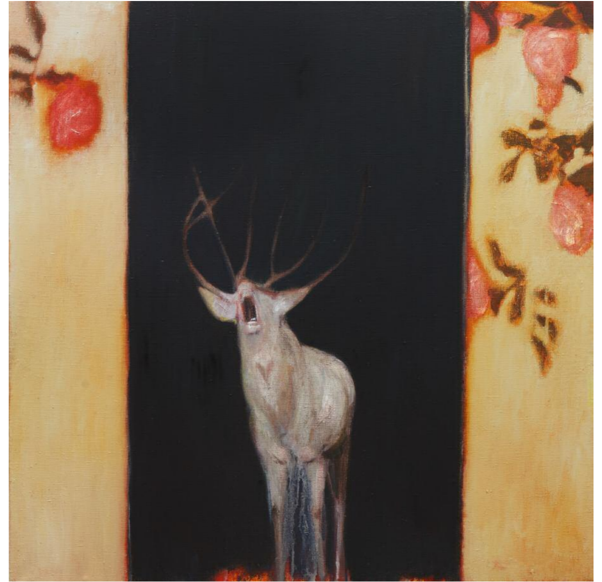
Anima 100 x 100 cm oil on canvas