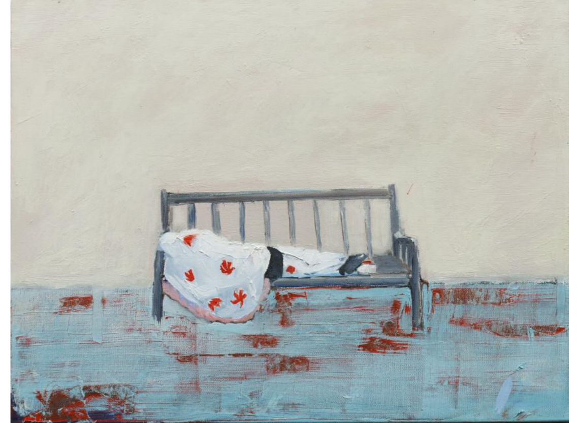
Stranger 50 x 60 cm oil on canvas