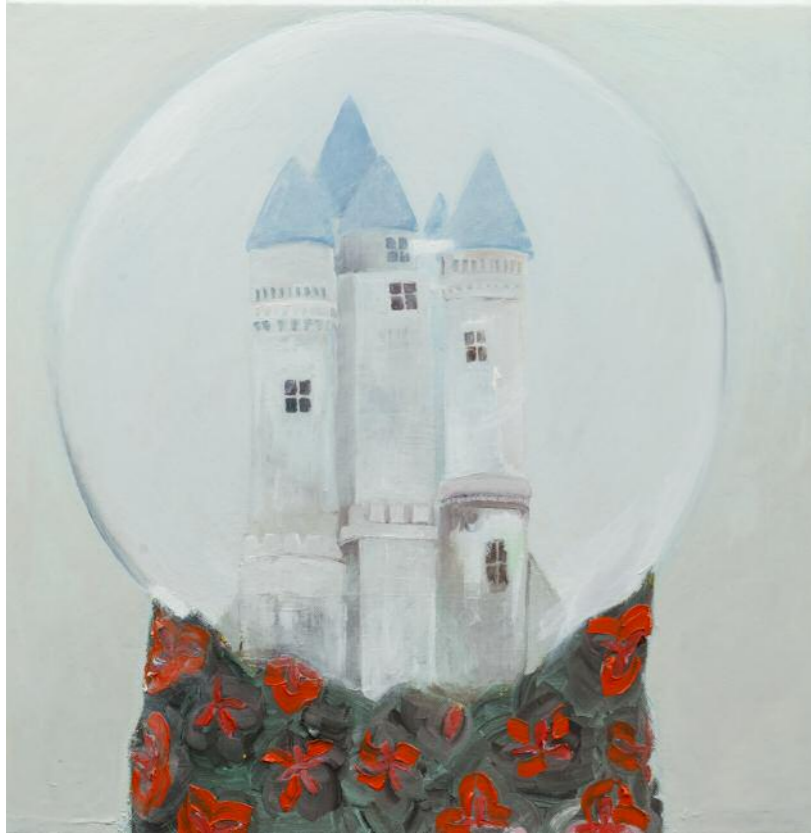
Castle in a bubble 60 x 60 cm oil on canvas