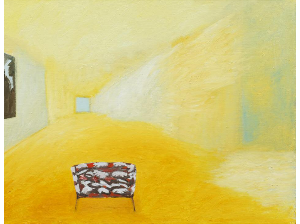
Consideration on a brighter future 70 x 90 cm oil on canvas