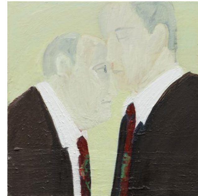
Dirty little secret 40 x 40 cm oil on canvas

2011 'The Print Show', The Exchange, Penzance Caxton Gallery, Whitstable St Anne's Gallery, Lewes 2010 St Anne's Gallery, Lewes MK Open Reality Check, the Newlyn Gallery 2009 NSA at the RWA, Bristol The Belgrave Gallery, St Ives 2008 'A Long Haul', The Ramp, The Exchange, Penzance 'The Drawing Show', The Exchange, Penzance 2007 jaggedart, London 2007/08 The Belgrave Gallery, St Ives Rainy Day Gallery, Penzance Itree Gallery, Bridport 2005/06/07/08 Campden Gallery 2003/04/05/06 Cadogan Gallery, London 2003 Hunting Art Prize, Royal College of Art 2002 Plymouth Art Gallery 2001/02/03/04/05 Badcocks Gallery, Newlyn 2001 Lemon Street Gallery, Truro 2000 New Millennium Gallery, St Ives