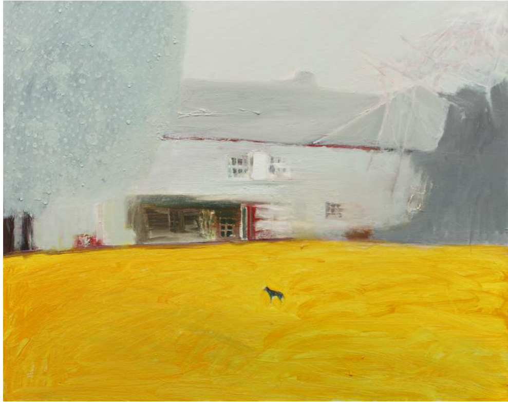
Where stories are told 60 x 75 cm oil on canvas