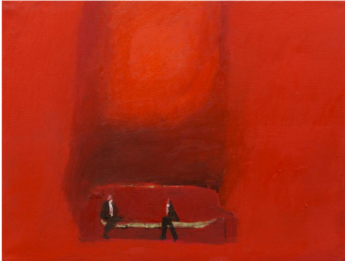
Secret talks 80 x 60 cm oil on canvas