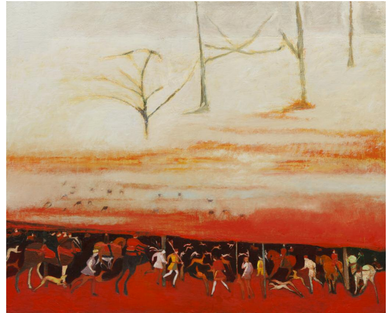
Playing like there is no tomorrow 115 x 140 cm oil on canvas