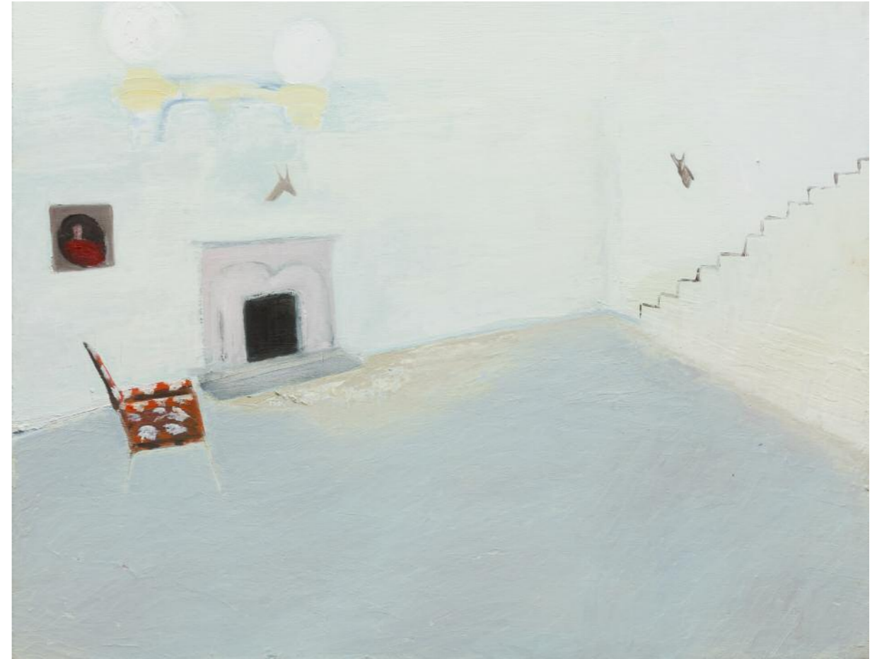
The invisible story teller 70 x 90 cm oil on canvas