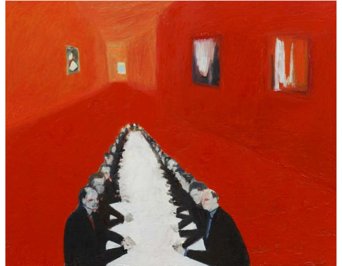
The fortune tellers 60 x 75 cm oil on canvas