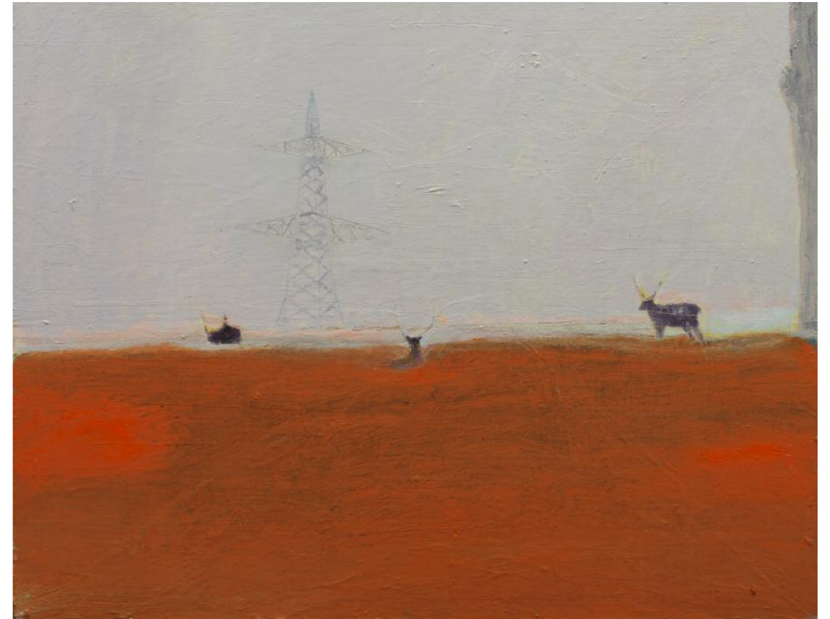
Obelisk 70 x 90 cm oil on canvas