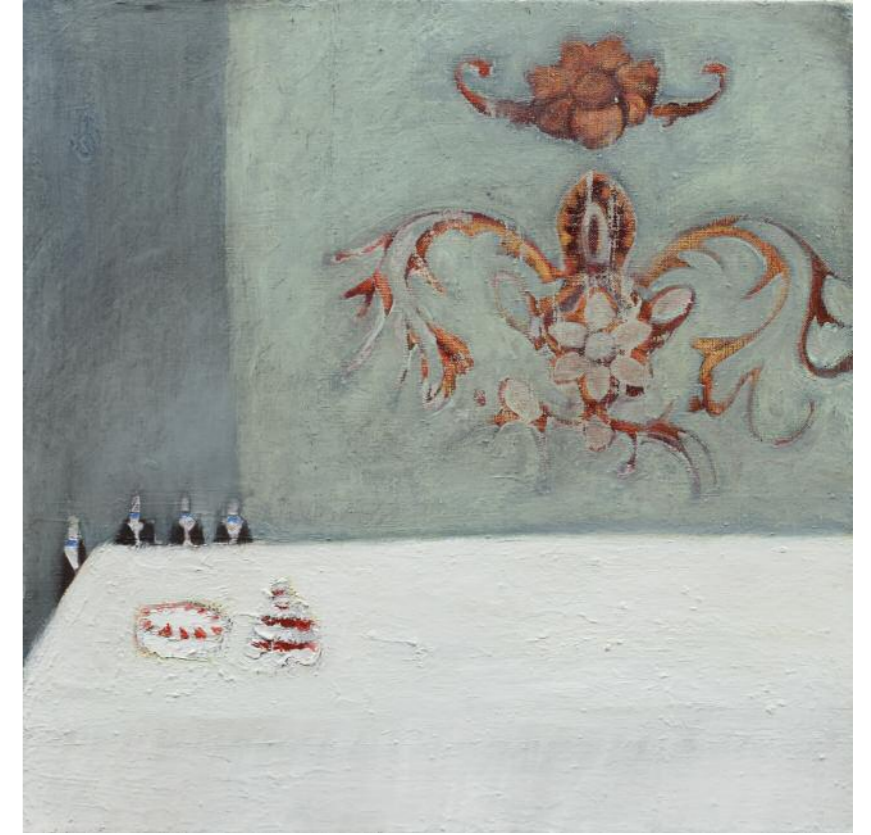
The cake eaters 60 x 60 cm oil on canvas