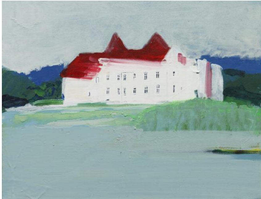
Mansion of delight 35 x 45 cm oil on canvas