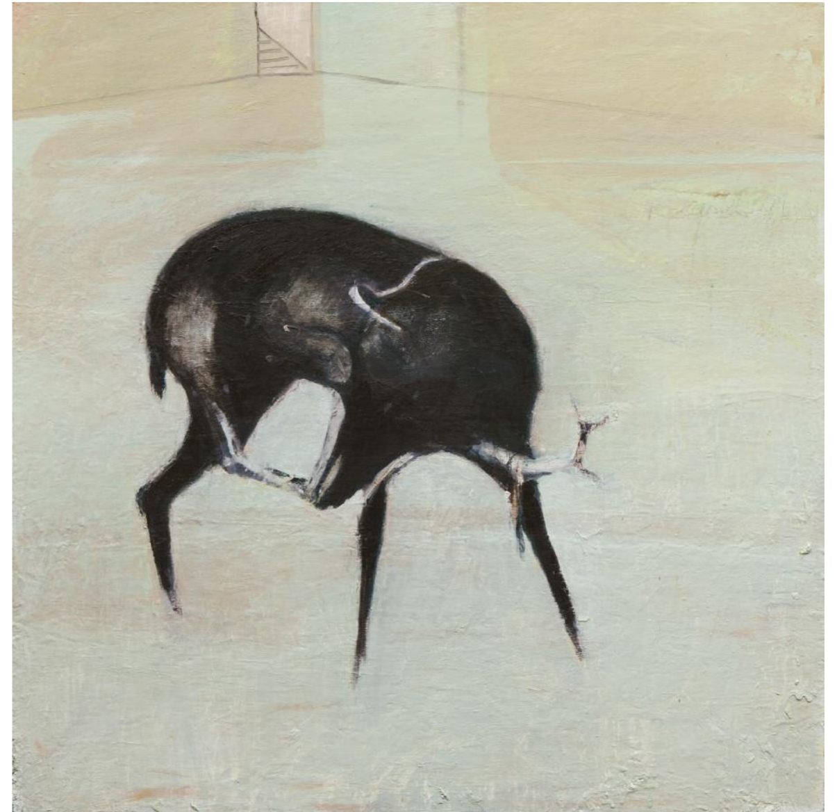
Basement 100 x 100 cm oil on canvas