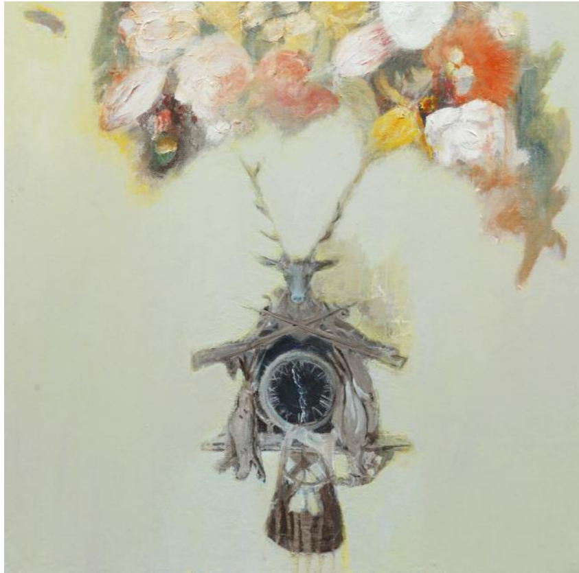
Cuckoo land 60 x 60 cm oil on canvas