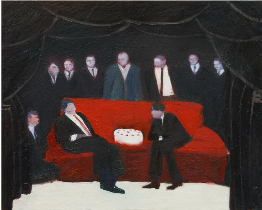
The village play 60 x 75 cm oil on canvas