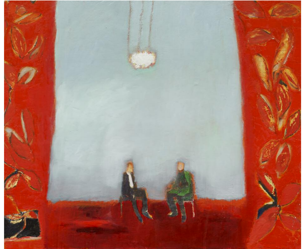
The great plans of men 75 x 95 cm oil on canvas