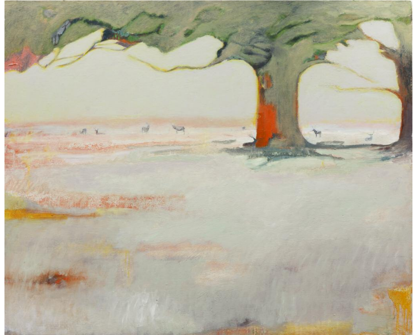
All is well in the garden 115 x 140 cm oil on canvas