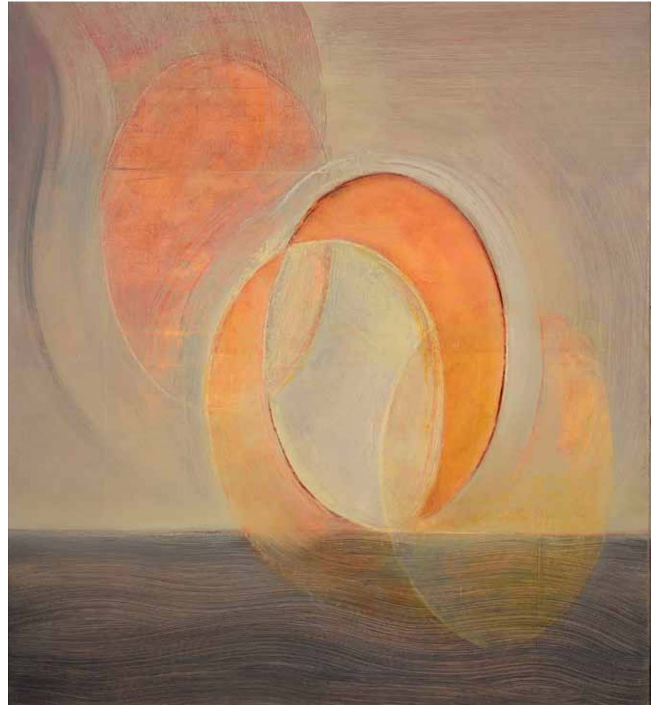
Skelter oil on canvas 102 x 92 cm