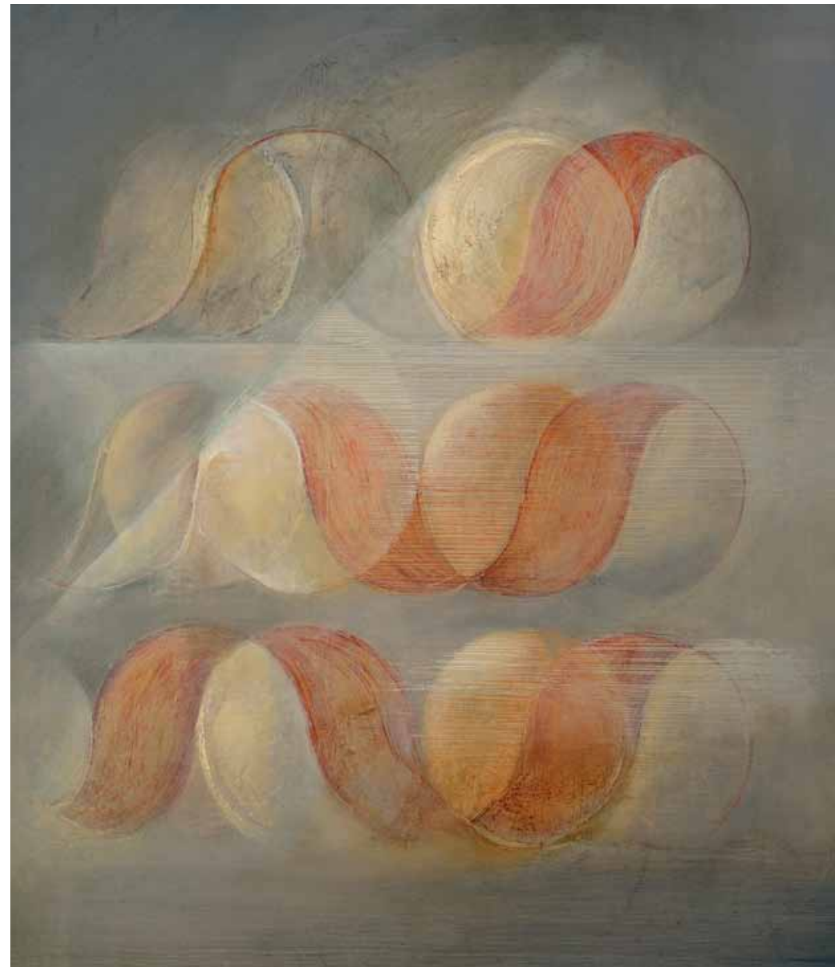
Three Crossings oil on canvas 100 x 90 cm