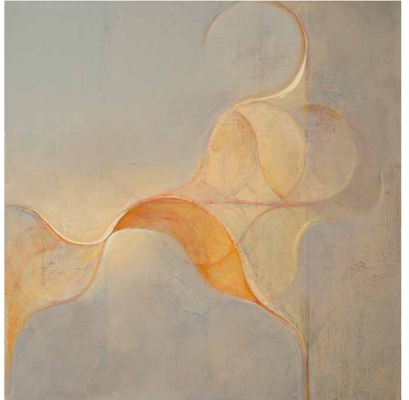
Stolen Moment oil on canvas 69 x 69 cm