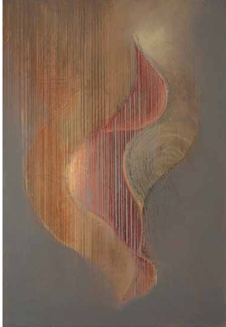
Late Arrival oil on canvas 61 x 42 cm