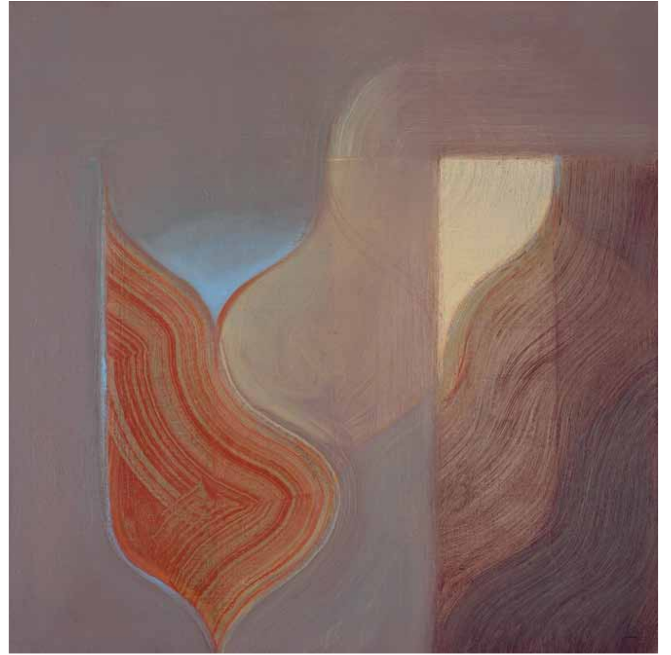
Fortune's Blue oil on canvas 75 × 75 cm