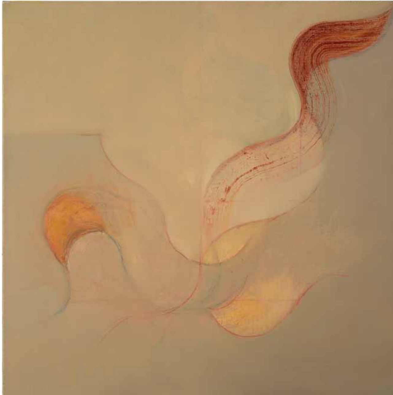
Remembered oil on canvas 75 x 75 cm