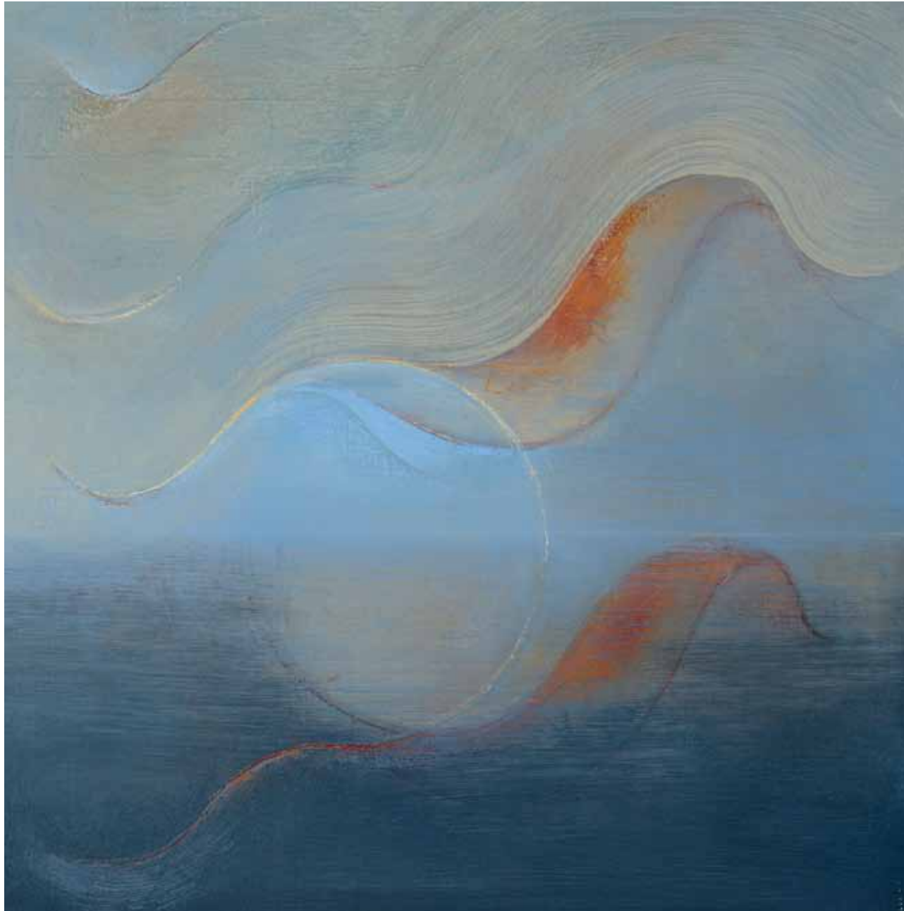
Nocturne oil on canvas 75 × 75 cm