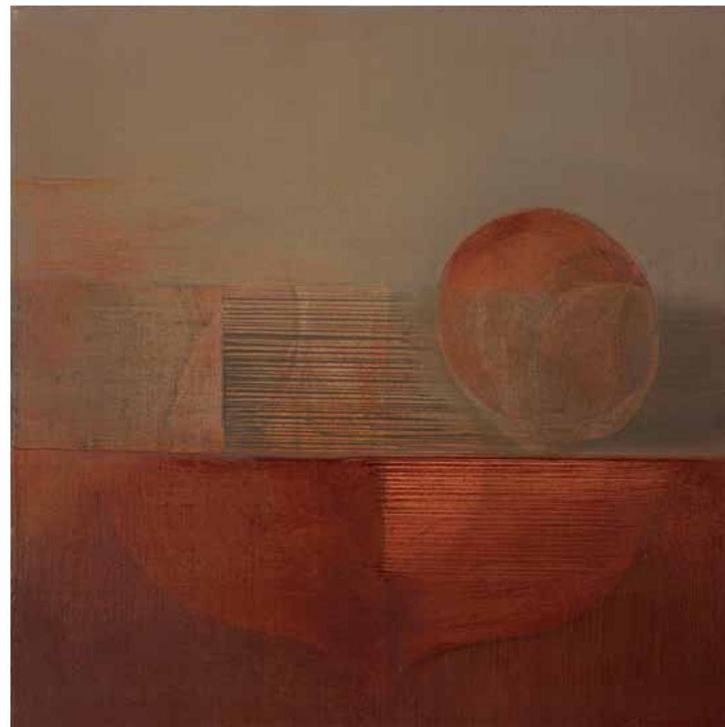
On Balance oil on canvas 60 x 60 cm