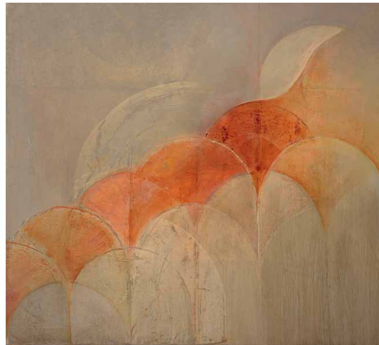
A shared Life oil on canvas 76 x 85 cm