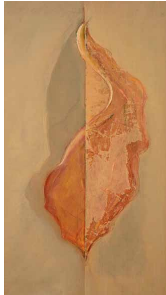
Point in Time oil on canvas 71 x 40 cm