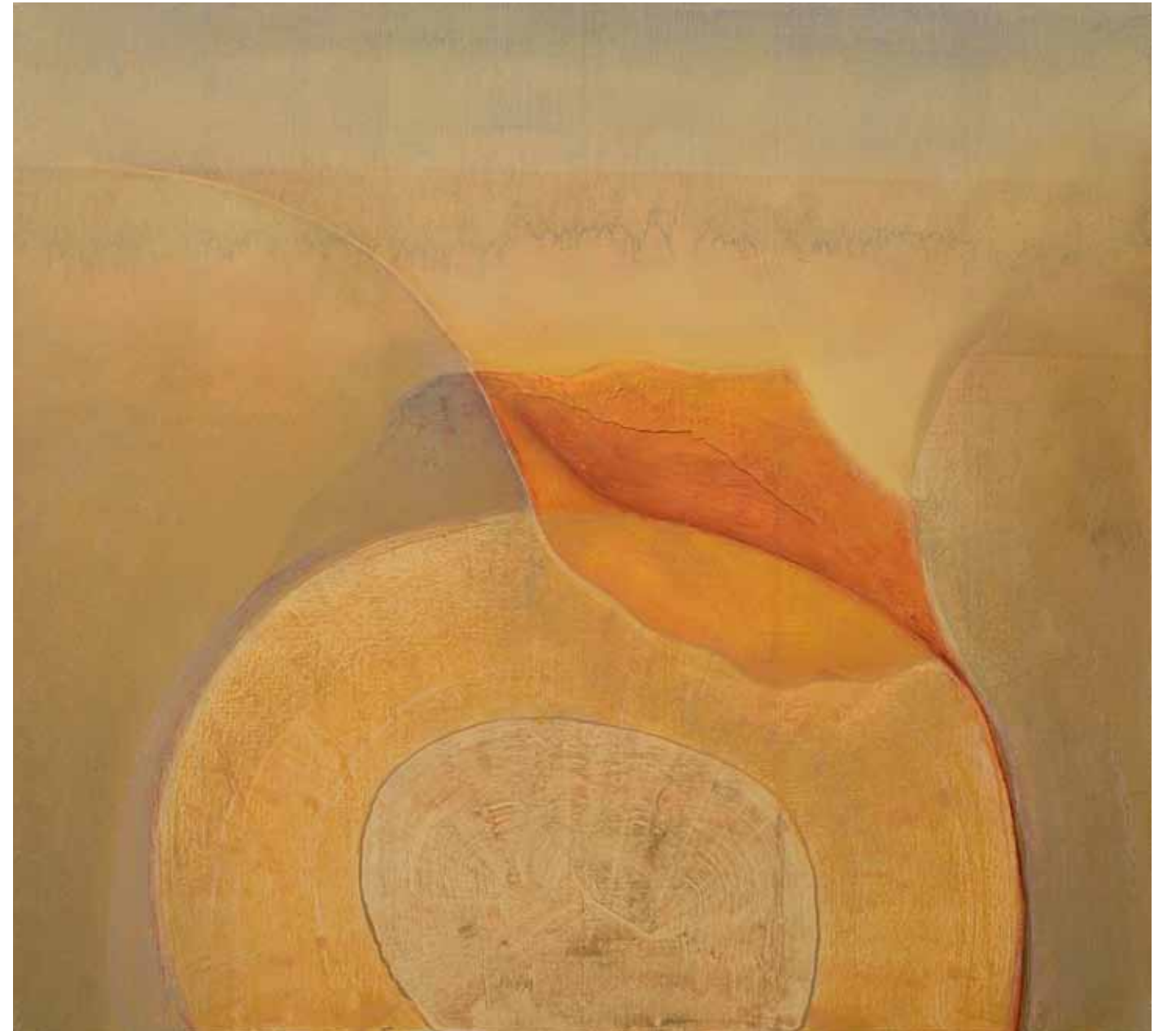
Nostalgia oil on canvas 76 × 85 cm