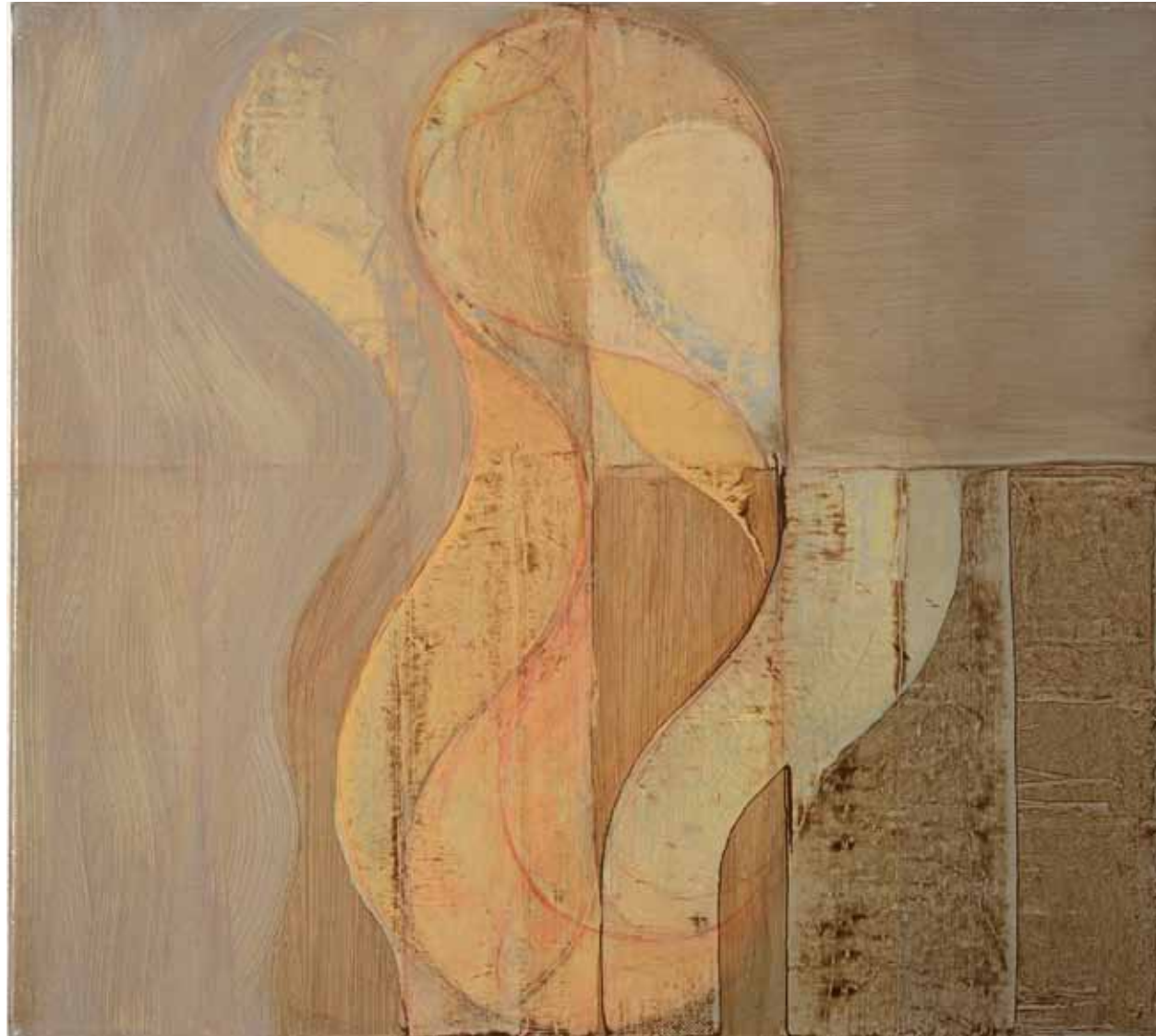
Master of None oil on canvas 69 x 77 cm