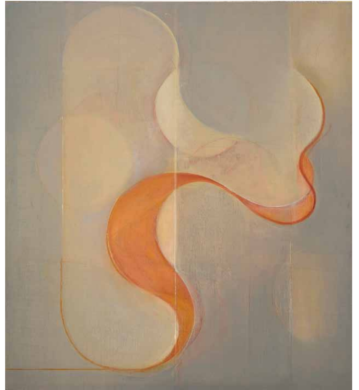
Wished For oil on canvas 100 × 90 cm