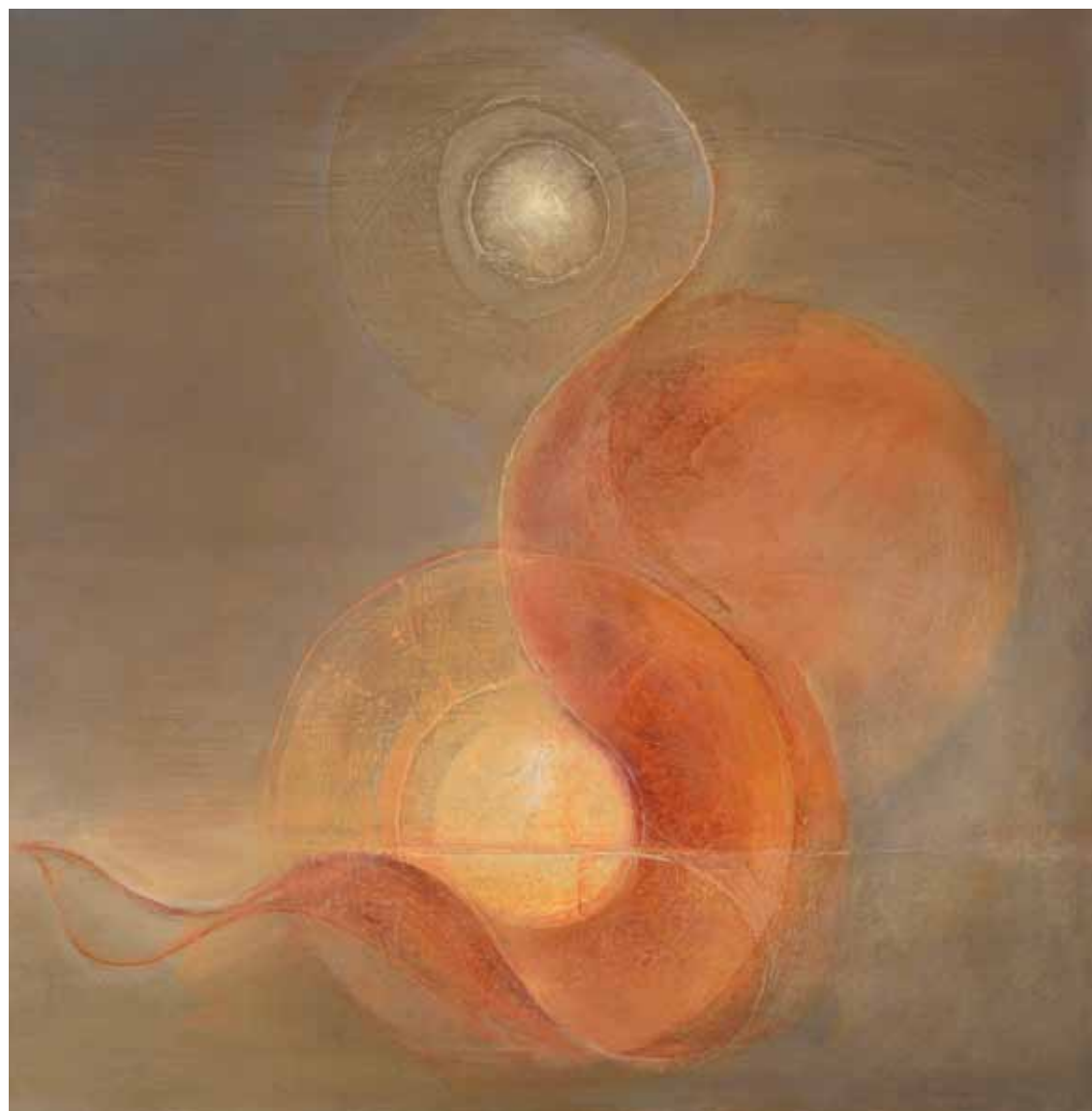
Star oil on canvas 76 x 76 cm