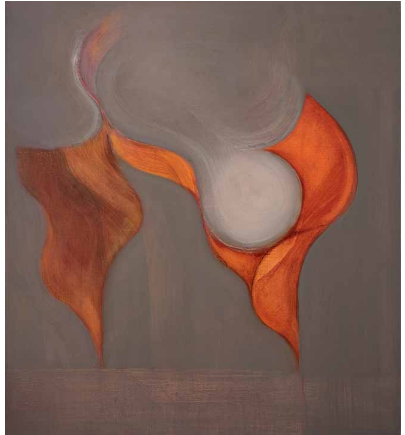
Opening Act oil on canvas 100 x 90 cm