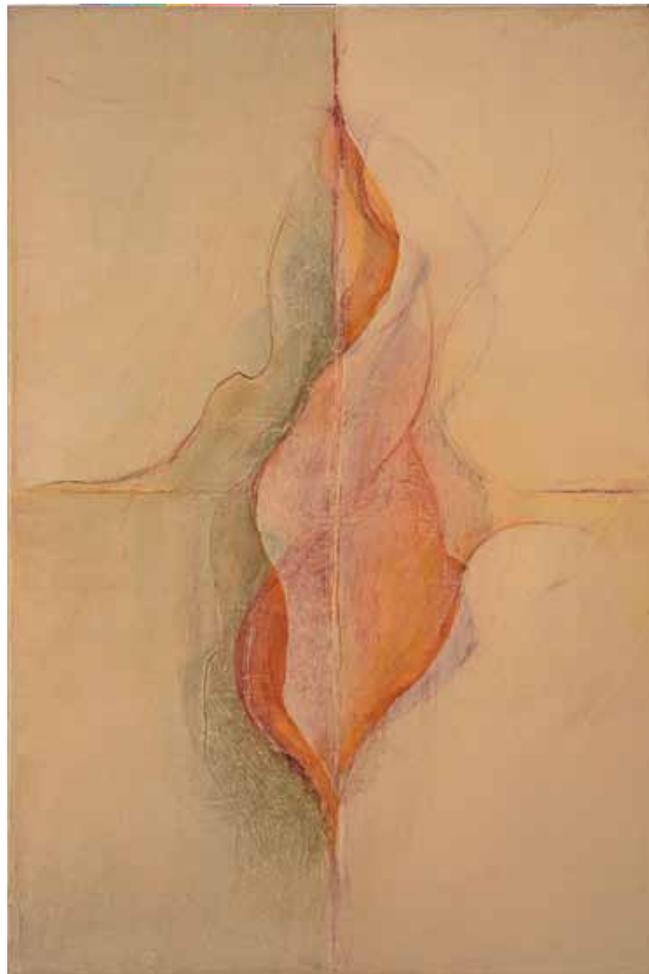
In Turn oil on canvas 76 × 51 cm